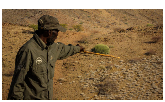
PACK FOR CONSERVATION