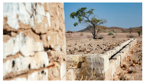
SUSTAINABLE MANAGEMENT PRACTICES