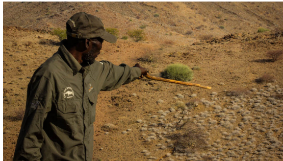
PACK FOR CONSERVATION