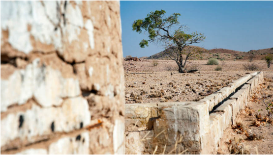
SUSTAINABLE MANAGEMENT PRACTICES