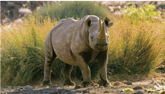
SAVE THE RHINO TRUST (SRT)